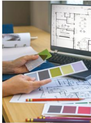
Architecture and Interior Design

Fitness instructors can get on video calls with clients, share workout schedules and diet charts, schedule calls, monitor progress, leave voice and video notes and accept payments.